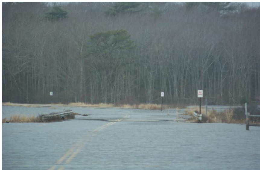
Furbish Road at High Tide