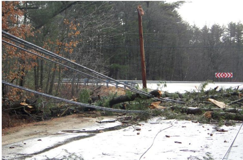
Intersection of Bragdon Road and Perry Oliver Road