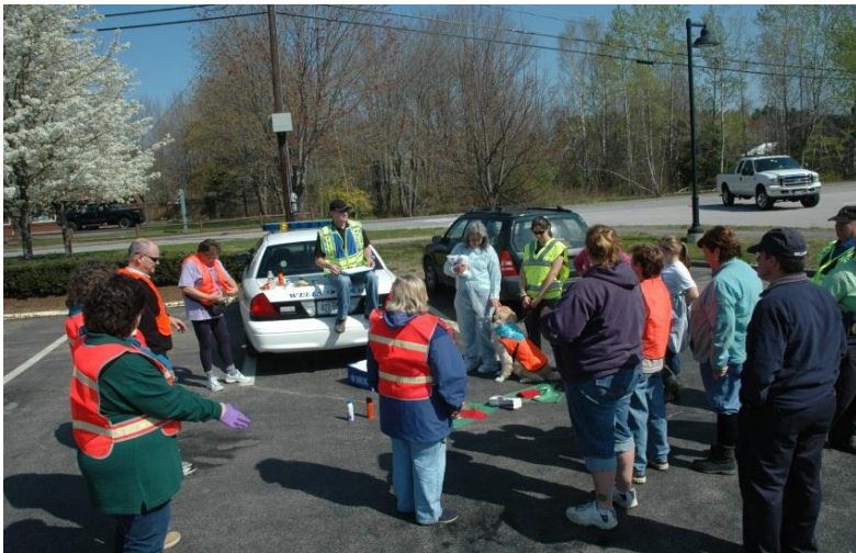
Town employees get ready for Earth Day activities.

Last April members of the police department and other town employees took part in Earth Day activities. These dedicated employees picked up a total of 122 bags of trash from the sides of Chapel Road, Mile Road, Fall Park Road, Wire Road and the parking lots on Mile Road and Gold Ribbon Drive. Thanks to all of you for your help.